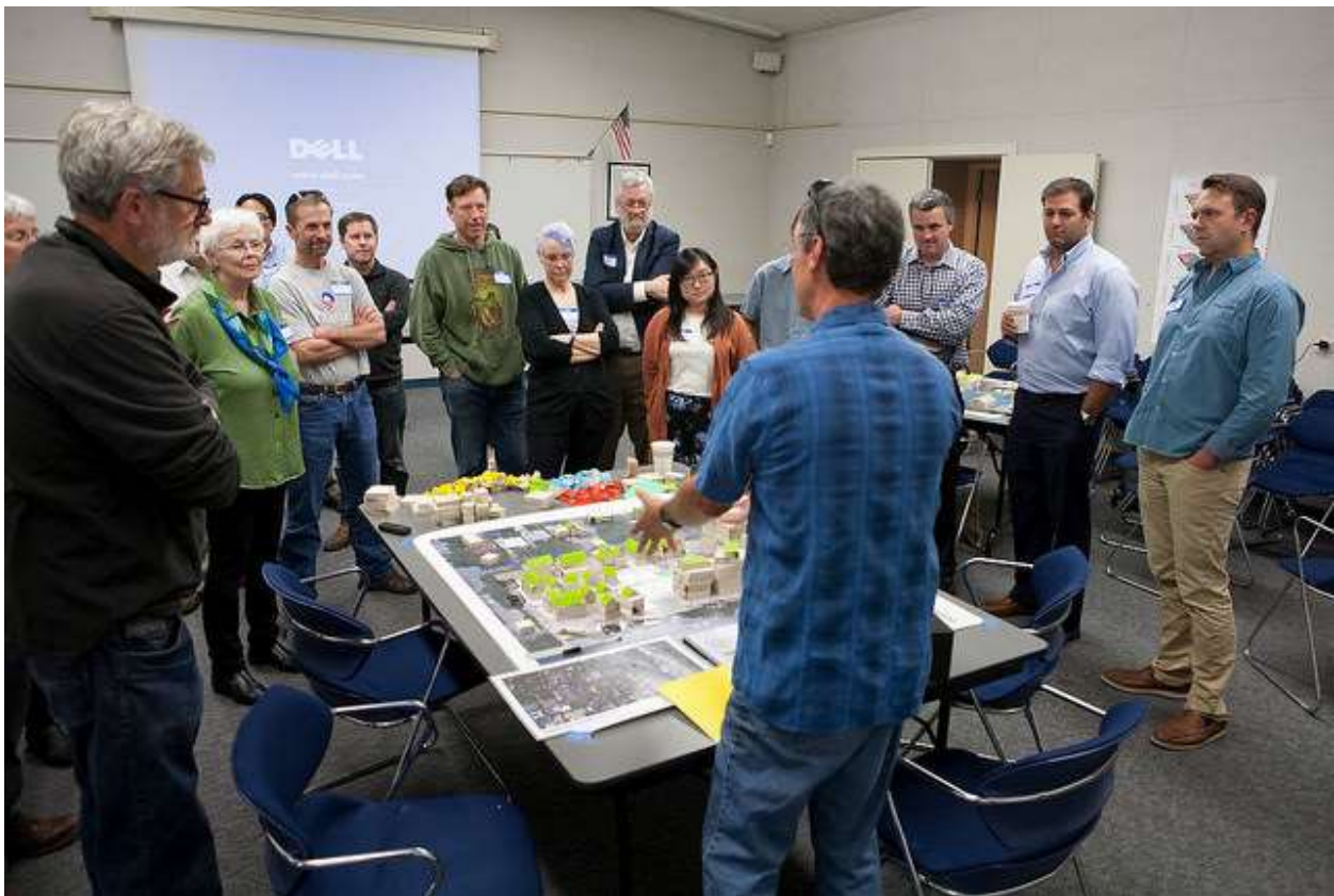
Figure 4: Participant presenting his group’s built outcome.

The purpose of the workshops was not to arrive at a community consensus or a particular design, (as would be done in a charrette) but to: