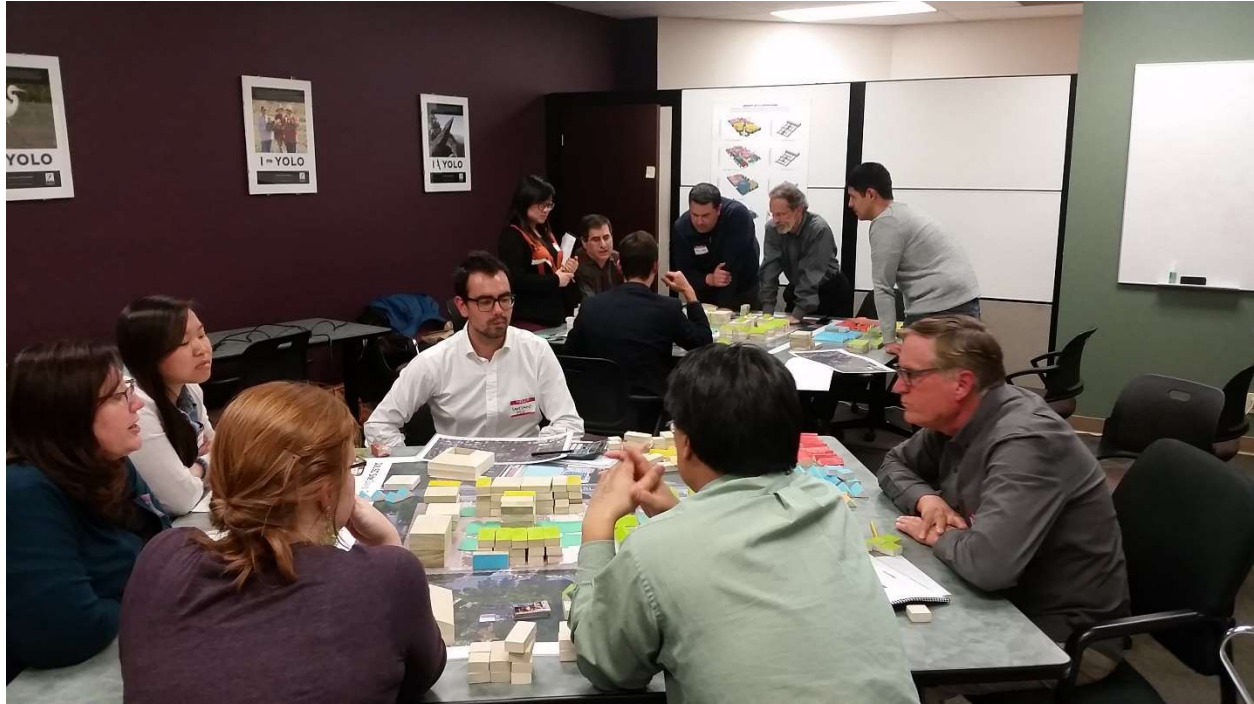
Figure 5: Test-run of the workshop with city and school district staff and a district board member.

advocates, neighborhood advocates, business owners, homeowners from a variety of neighborhoods, developers, and other professionals.