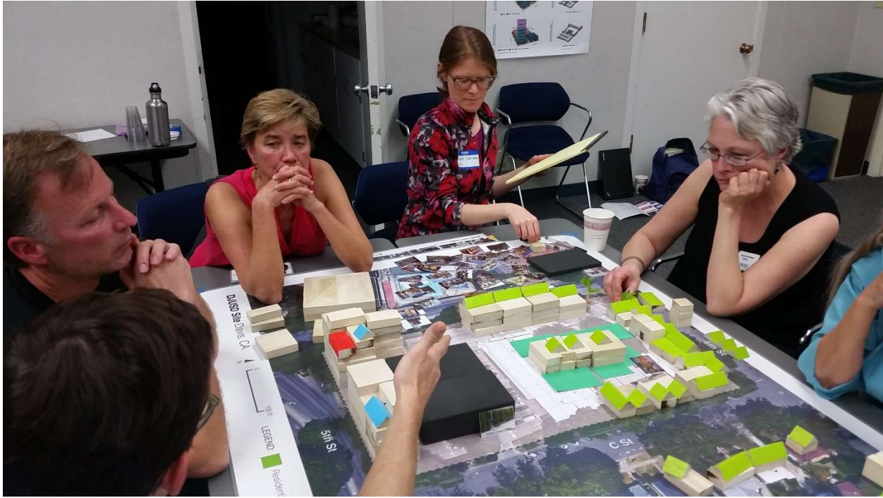
Figure 3: Table of community members at a site brainstorming workshop.

Design professionals and students, facilitators, and an expert in development economics were available to answer questions and help participants with the exercise.