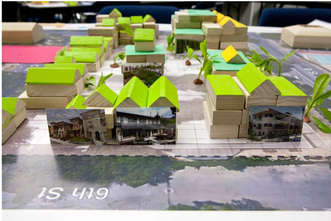
Figure 6: Street trees, green roofs and gardens were a prominent part of this group's concept.

A significant number of landscaping and green design elements featured in many of the concepts. Landscaping ideas took the form of gardens or small parks and also retention or replacement of street trees (see Figure 6, below).