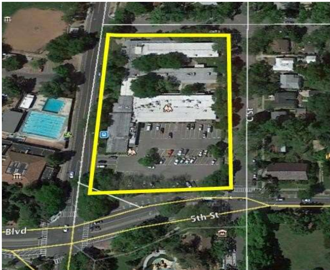
Figure 1: Property owned by the Davis Joint Unified School District.

This project was designed to help the city government and its residents address the popular fears of, and regulatory barriers to more efficient, higher density growth and development that conforms to the direction of SACOG's Blueprint Principles, and more recently to its Sustainable Communities Strategy, which addresses the intent of watershed state planning legislation, Senate Bill 375. Toward this end, we focused on a property owned by the Davis Joint Unified School District (DJUSD) immediately north of the downtown district (Figure 1 below).